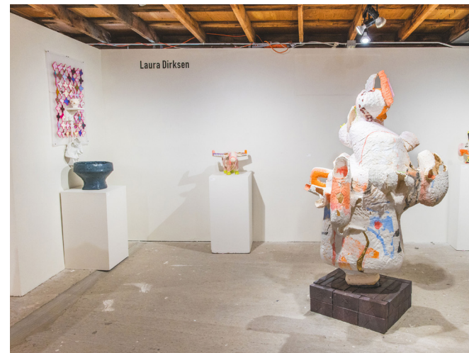
2024 Resident Artist Exhibition