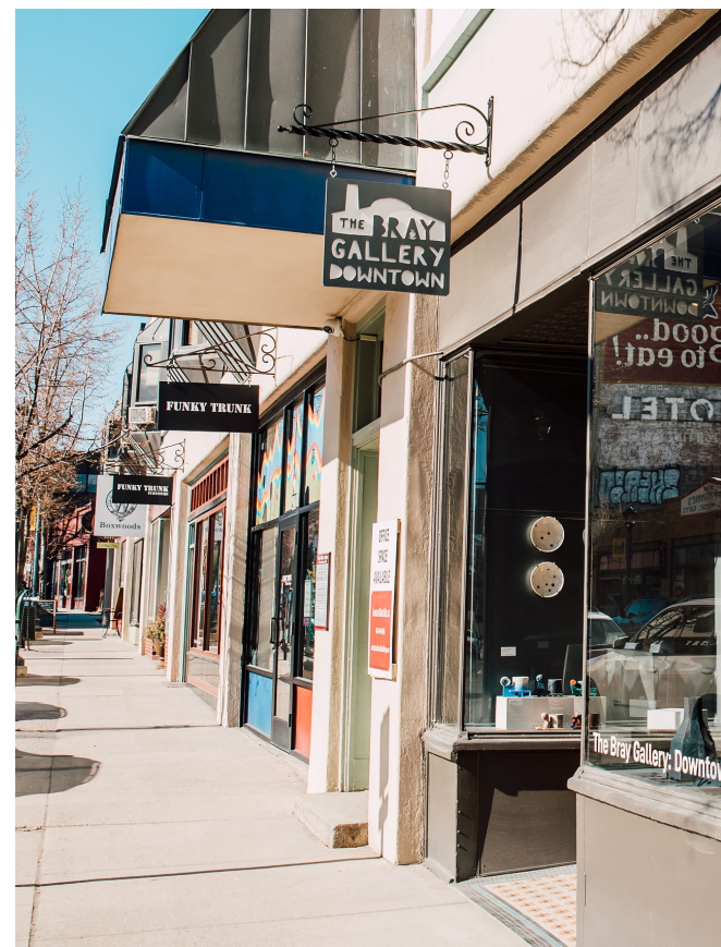
The Bray Gallery: Downtown Grand Opening