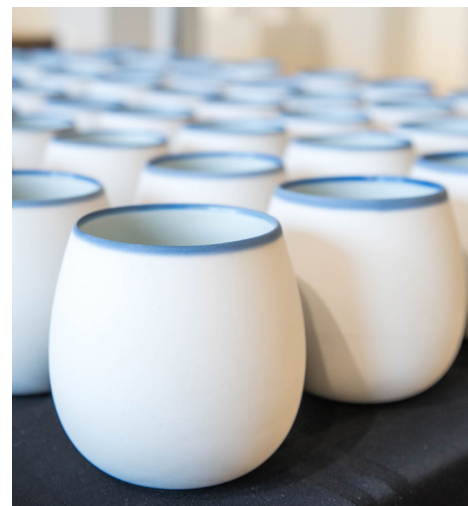
2024 Wine Tour