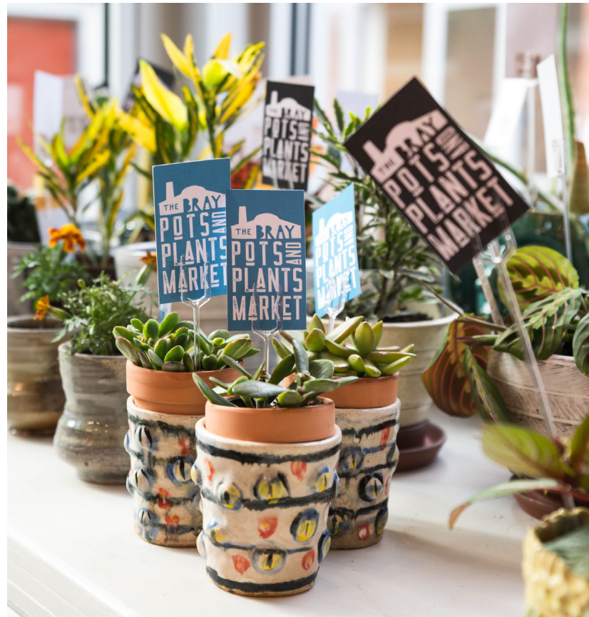
2024 Pots and Plants Market