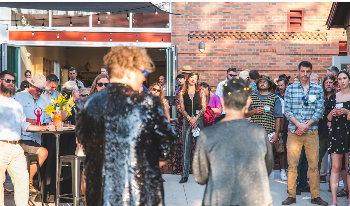
2024 Archie's Avant Garden Party